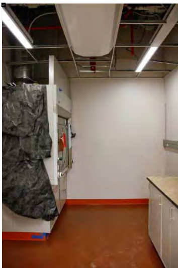
2 nd floor fume hood and sink alcove room.