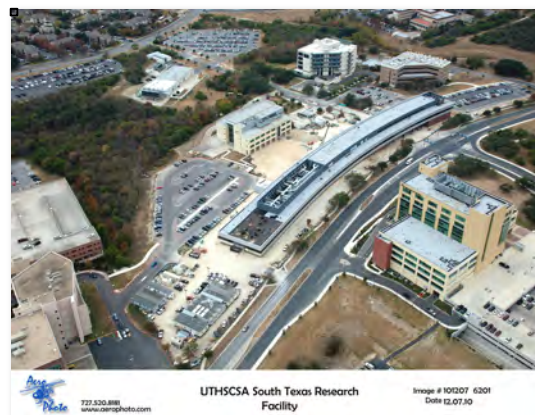
Aerial view taken December 7, 2010.

A. Office space for laboratory-based investigators will not be included in the RSPI calculation. However office space for office-based investigators will be included. HOP 7.8.1 "Research Space Allocation Policy" is being revised to clarify these issues.