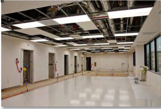
2 nd floor open laboratory.