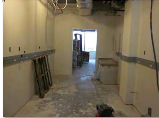
2 nd floor linear equipment room.