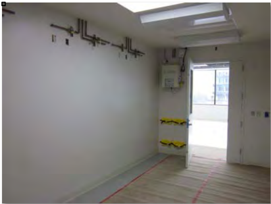
2 nd floor tissue culture room before hood installation showing CO 2 control unit.